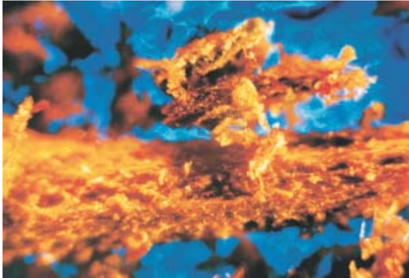
Figure 3 macrophotos

(C) Macrophoto after several passages of hot air from the Volcano. The resin has disappeared, and trichomes have withered, but non-incinerated fibrous material remains.