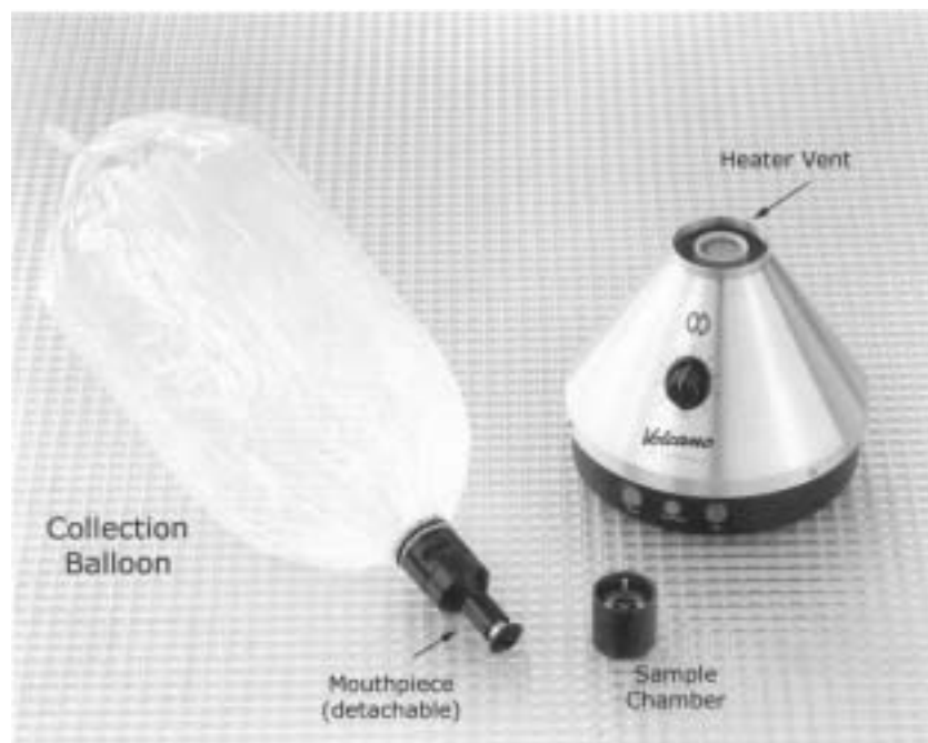
FIGURE 1. The Volcano® Vaporizer